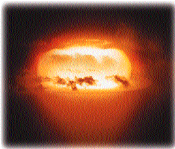
Several conditions must exist before Jesus Christ returns, according to Bible prophecy. One condition is mankind's ability to annihilate all human life, only possible since the development of nuclear weapons in recent decades.

Christ described conditions under which, as the end time approached, Jews would again control Jerusalem and the "holy place." Later He said the holy place would be desecrated. He stated, "Therefore when you see the