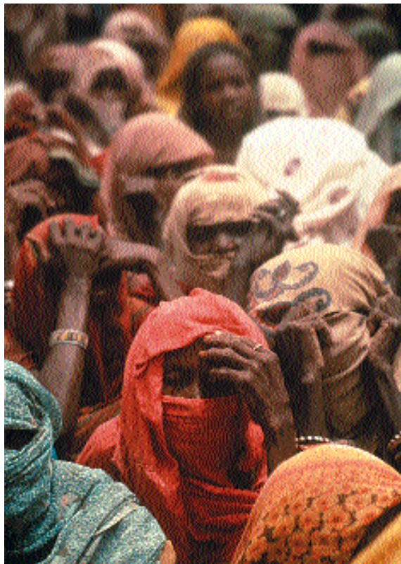
"And there will be famines . . ." said Jesus Christ when He described trends leading up to His return. Here malnourished Ethiopians gather for food in a refugee camp.

According to 1990 UN statistics, Tokyo was the most populous city, with 25 million, followed by New York City's 16 million. But the UN calculates that in the next 15 years the largest cities will be in poor nations, such as Bombay, India, with 28 million; Lagos, Nigeria, with 24 million; Shanghai, China, with 23 million; and Mexico City and São Paulo, with 20 million. Can these impoverished nations continue to provide basic services and enforce the peace as their resources dry up?