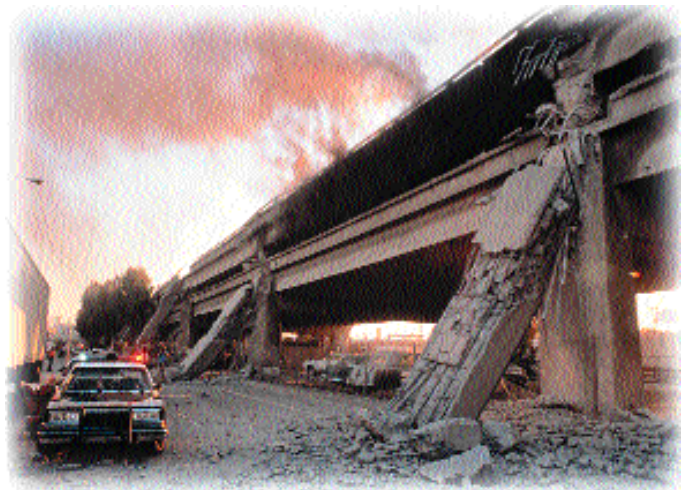
One of the signs Jesus predicted would be “earthquakes in various places.” A 1989 earthquake near San Francisco killed 63 and caused $5.9 billion in damages.

Jesus predicted other signs that will mark that increasingly threatening time. He said a ruthless persecution against God’s people—this time on a worldwide scale—will again emerge: “Then they will deliver you up to tribulation and kill you, and you will be hated by